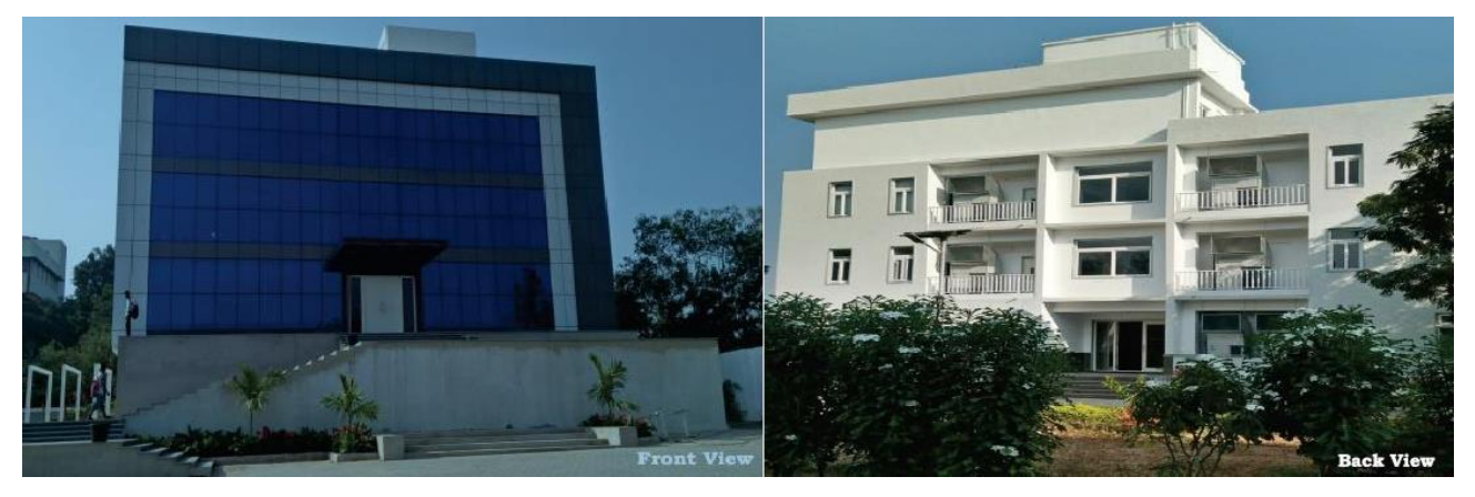
Figure 1: R&E Hub Front view and Back view

The institution has been actively involved in multidisciplinary areas of research and promotes engagement with industries through consultancy services. The research and consultancy activities are being taken up by the dynamic and experienced members of the institution. Young and enthusiastic minds of under graduate, post graduate and Ph.D students actively participate in all these activities. The institution is keen to foster the development of research in the diverse area of sciences, technology and management and create a wealth of human resources in specified fields.