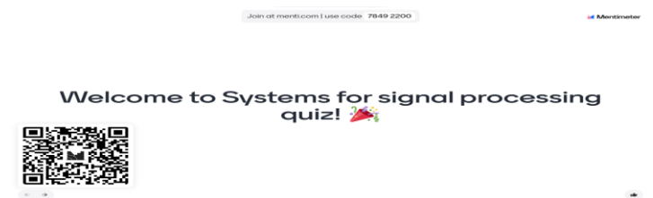
Fig 1.First slide with Link and QR code to join students