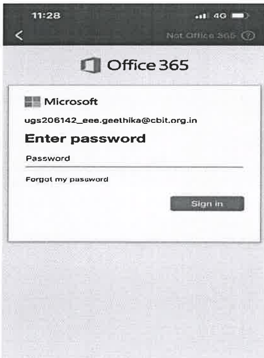
Figure 1 Student Email Login Page

ugs21001_cse.meghana@cbit.org.in pgs22001_eee.narasimhulu@cbit.org.in