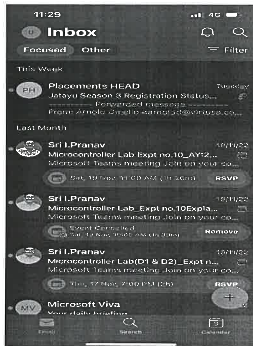
Figure 2. Email page of Student Mail