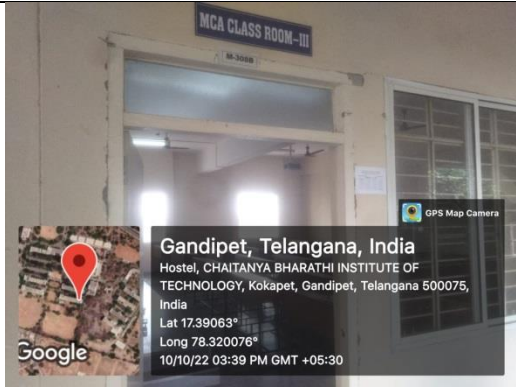
MCA CLASS ROOM-III (M 308B)