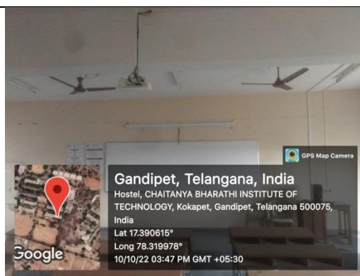
MCA CLASS ROOM-I (M 201B)