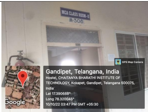
MCA CLASS ROOM-II (M 308A)