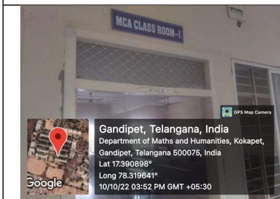
MCA CLASS ROOM-I (M 201B)