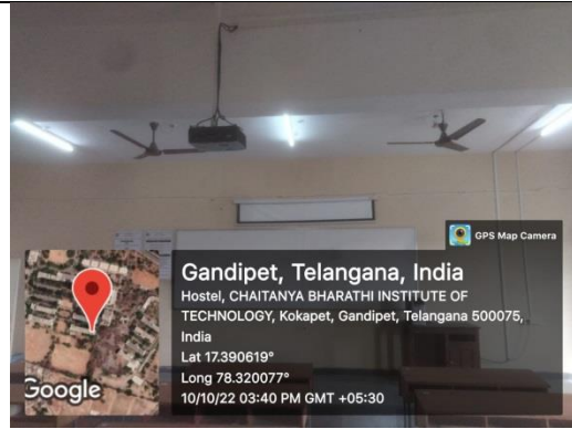
MCA CLASS ROOM-III (M 308B)