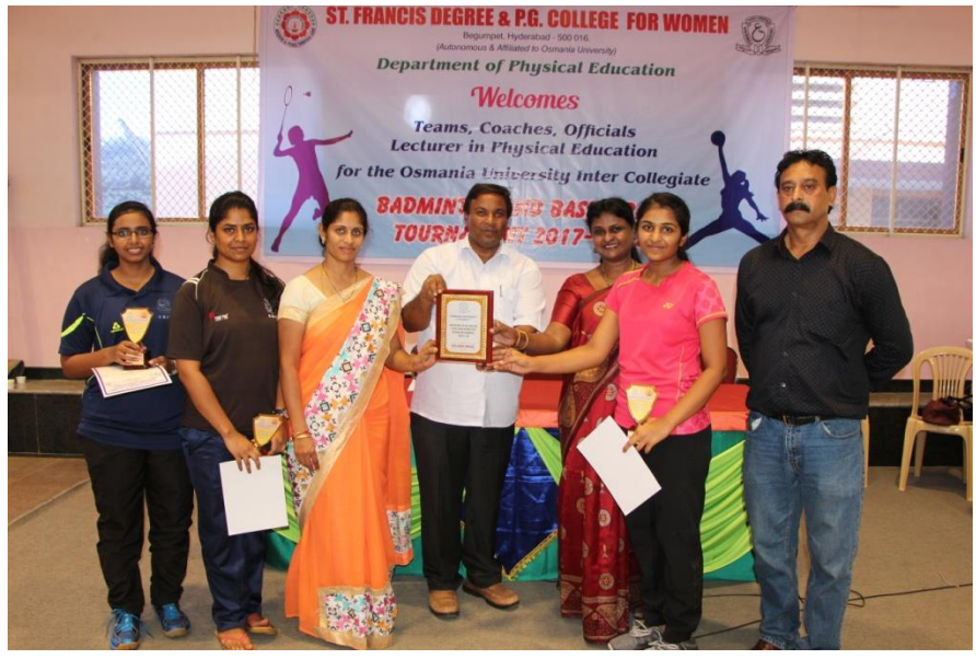
<u>Women Badminton Team</u> BITS Hyderabad organized National Annual Sports Festival – ARENA'18 – Winners VNR VJIET organized 10<sup>th</sup> Indian Open Inter Engineering Collegiate Sports Fest 2017-18 – Winners

National institute of Agricultural Extension Management, Hyderabad Organised Inter College Sports Meet – Olympus'17 – Winners