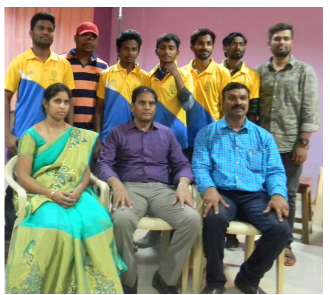
OU Inter college Tournament – Carroms – Men – IV Place @ CBIT, 9<sup>th</sup> & 10<sup>th</sup> February 2018