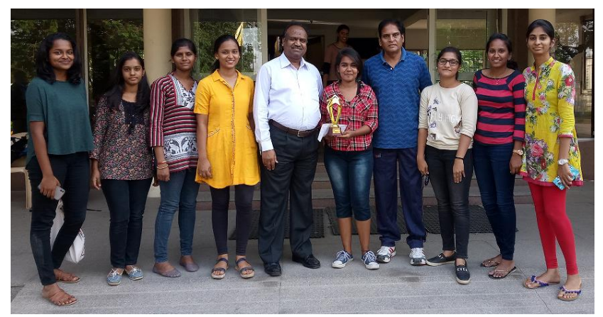
• Throwball – Women – Winners