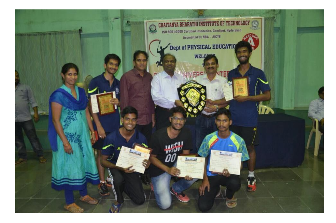
Men Badminton Team O.U Inter College Tournament – Winners

National institute of Agricultural Extension Management, Hyderabad Organised Inter College Sports Meet – Olympus'17 – Winners