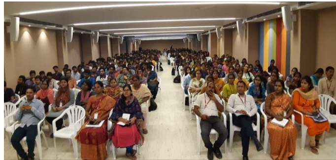
CBIT Students participated in cyber security campaigning fortnight orientation program