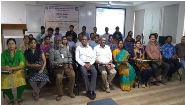
Short Term Training Program (STTP) on Development of Laboratory Instruction and Manual, Organized by NITTR Kolkata, CBIT C-203 on 4 th -8 th February 2019, (One Week).