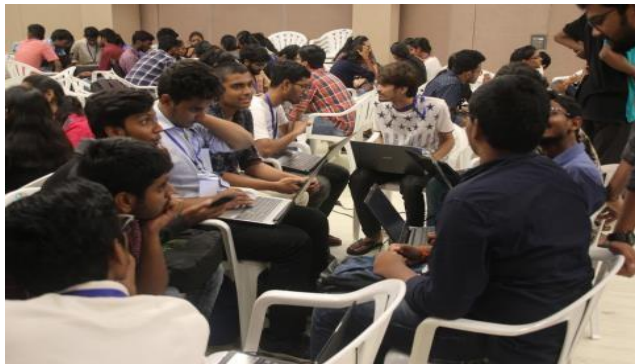
Participants working in Group activity of Django camp