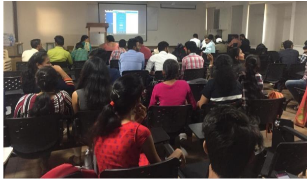
Participants Sharing their Ideas in Kony Hackathon