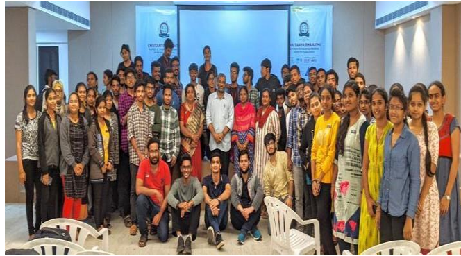
Students worked over night in Hacktoberfest Hackathon 2019.

CBIT, Hacktoberfest Hackathon 2019 Training & Placement office, 25 th and 26 th October 2019