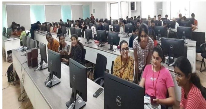
Students Participated in Microsoft Gaming Event.