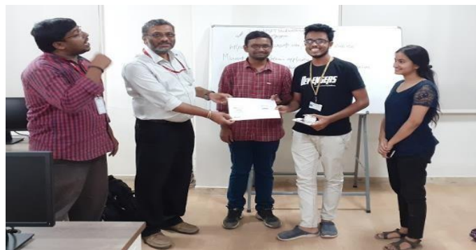
Prize Distributed to the Winner of Microsoft AI Gaming Event, 2020.