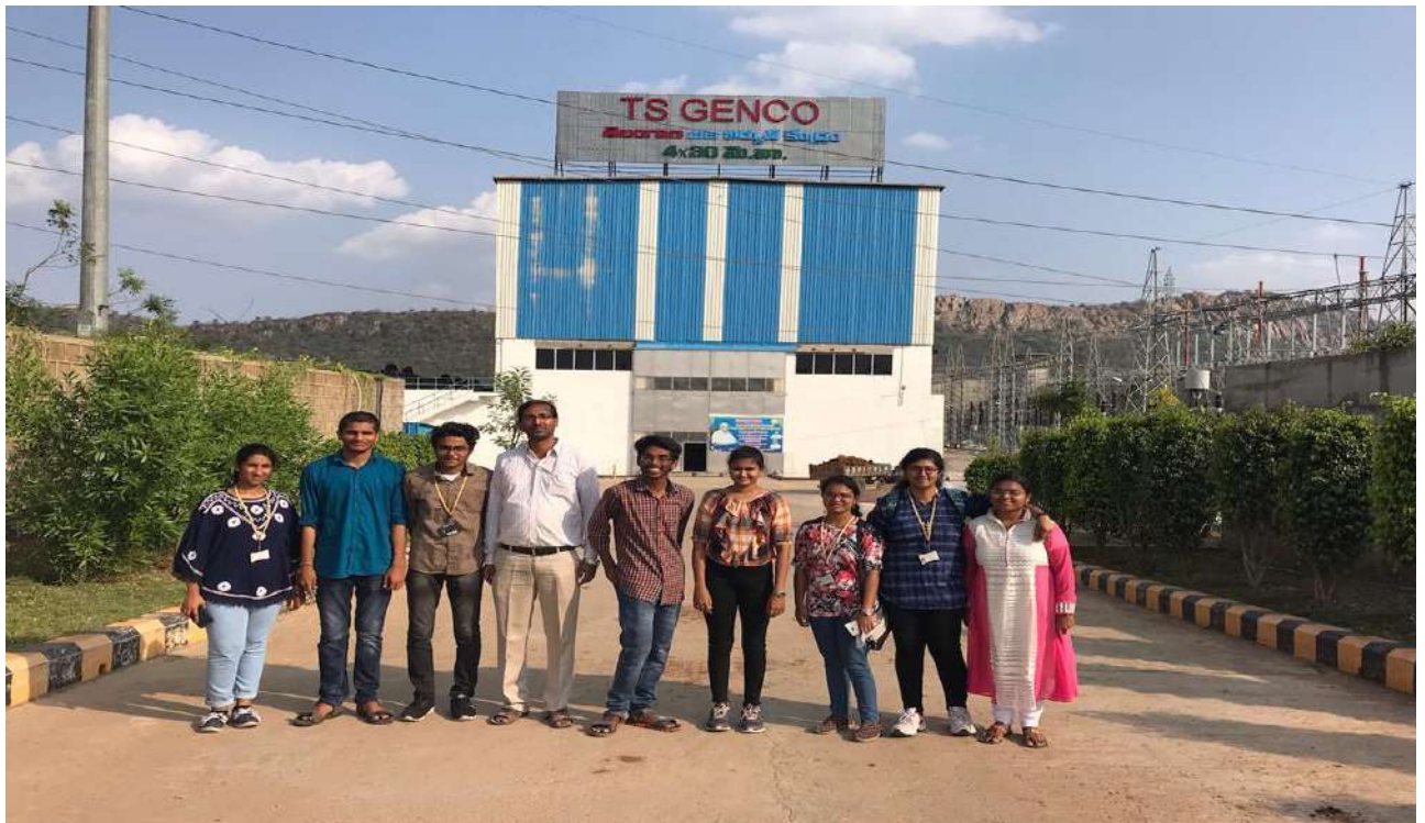
Visit to Pulichintala Hydel Power Plant