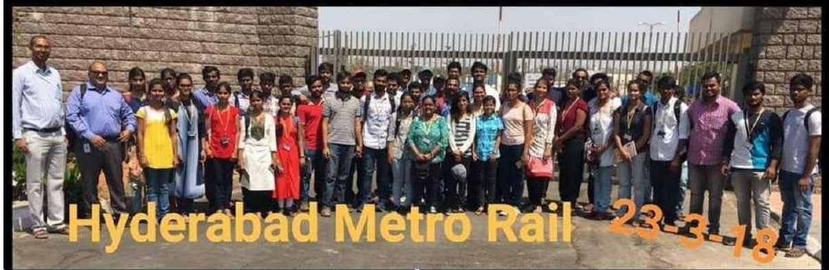
L&T Hyderabad Metro Rail Project visited by Students