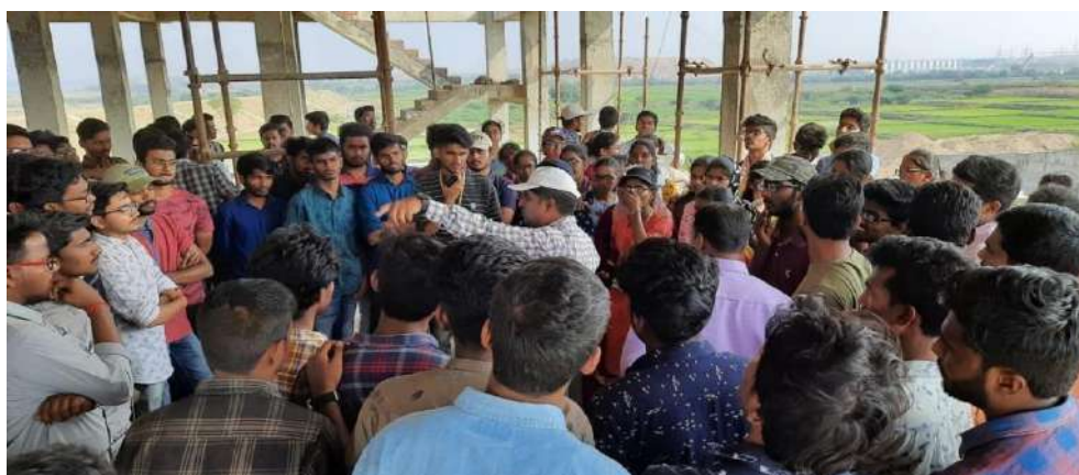
Sundilla Pump House, Kaleshwaram Lift Irrigation Scheme Project