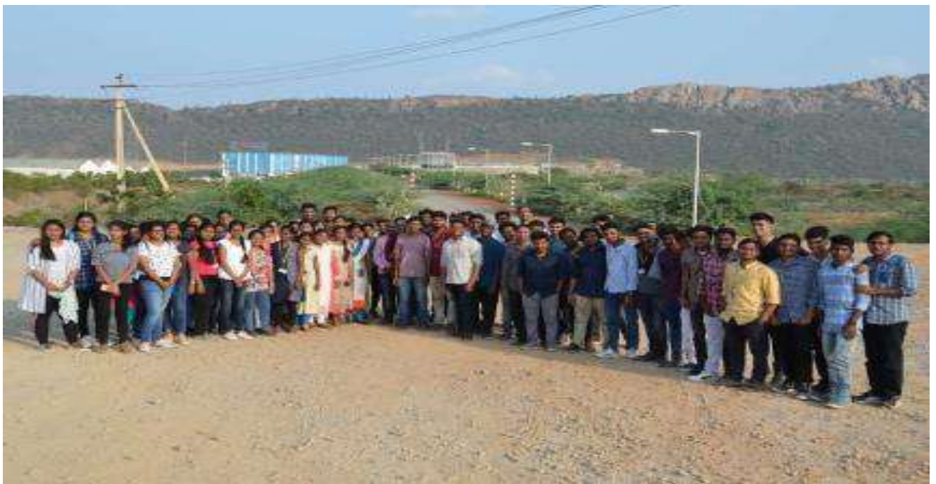
PCHES, Pulichintala, Kodad