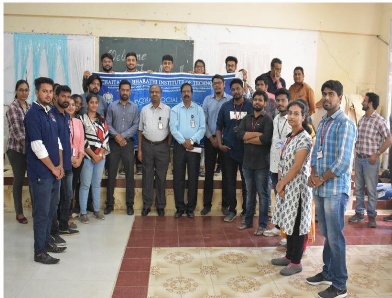
Inaugural of Health camp in CBIT