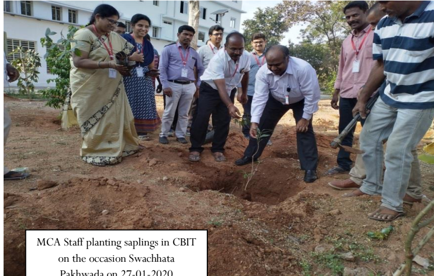
MCA Staff planting saplings in CBIT on the occasion Swachhata Pakhwada on 27-01-2020