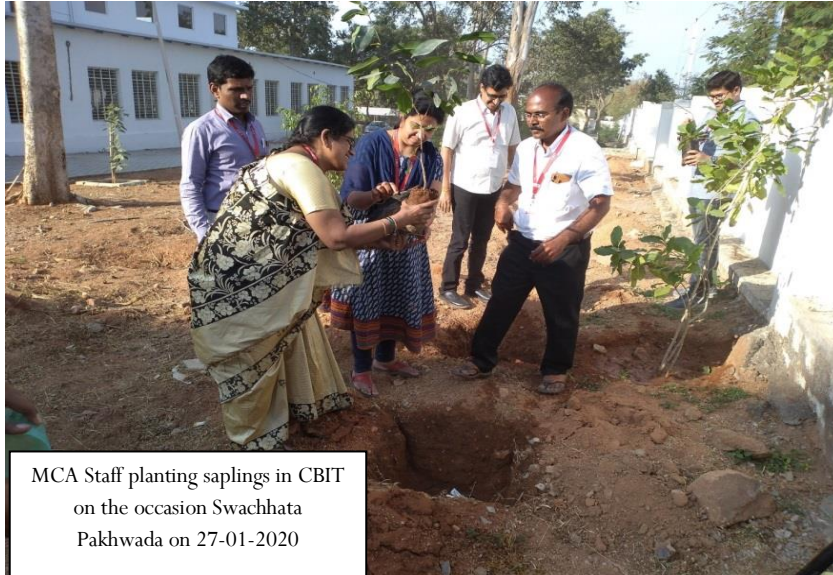
MCA Staff planting saplings in CBIT on the occasion Swachhata Pakhwada on 27-01-2020