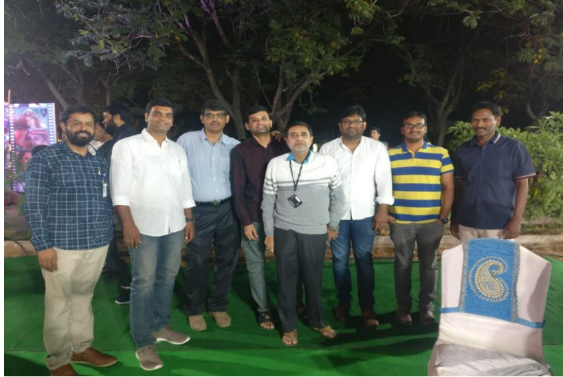
MCA faculty with alumni on 25-12-2019