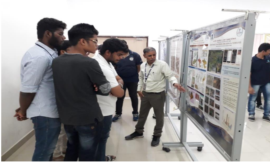
MCA students listening to a Scientist at NRSC, Hyderabad