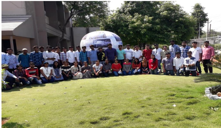
MCA Students at NRSC Campus, Hyderabad