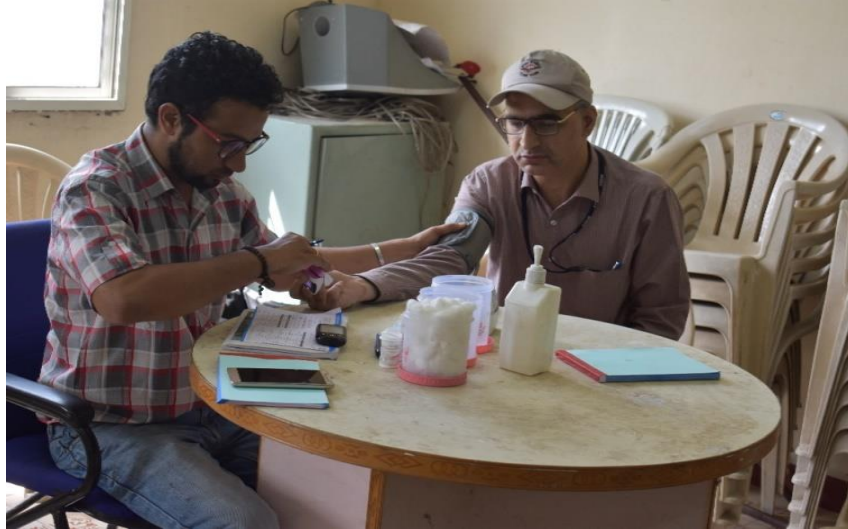
Health camp is under process