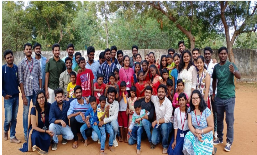
NSS CBIT team in Aadharana orphanage