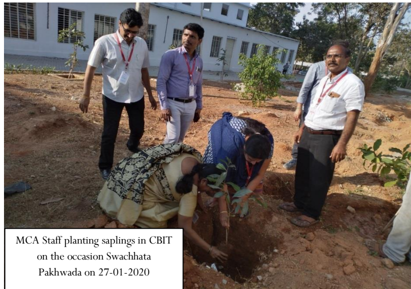
MCA Staff planting saplings in CBIT on the occasion Swachhata Pakhwada on 27-01-2020