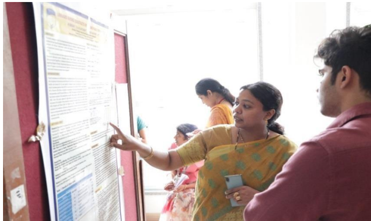
Participant explaining her poster presentation to the session chairperson