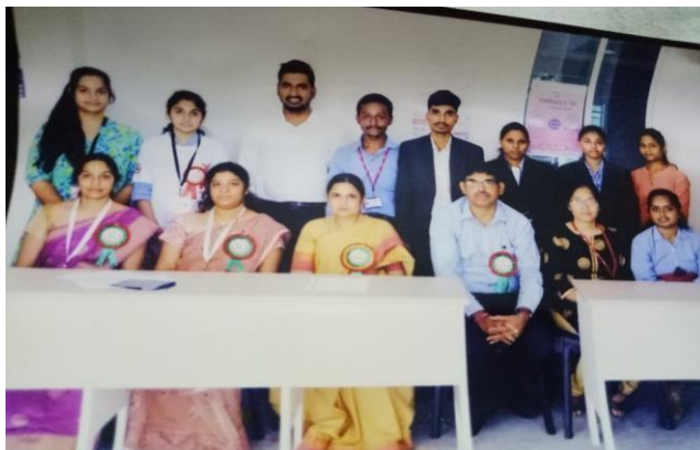
Staff and Students of SMS during Yukthi 2K19