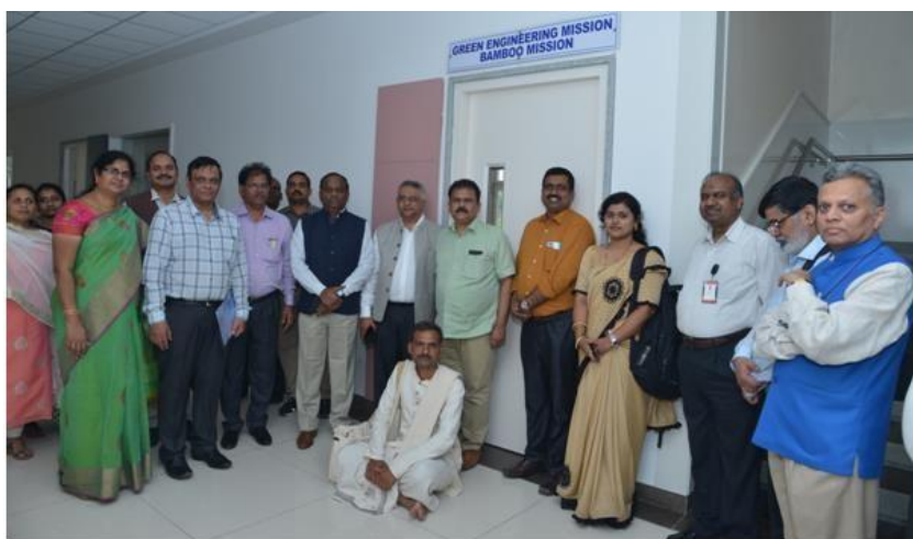
All the members of Bamboo Mission visited R&E Incubation centre, CBIT