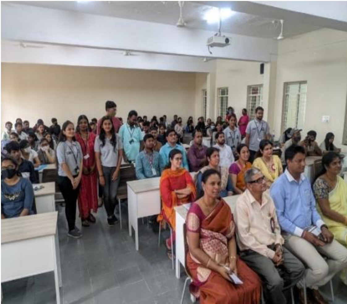
Faculty Members, Students and Participants during the event.