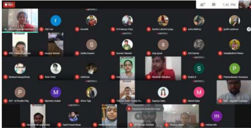
Faculty Members, Students and Participants during the event.