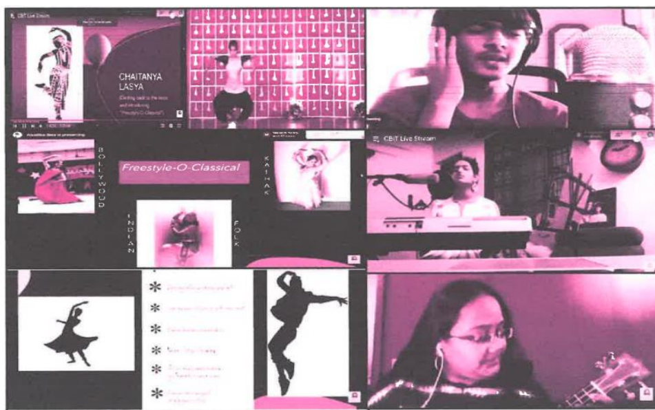
Students presenting different creative skills as a part of the clubs