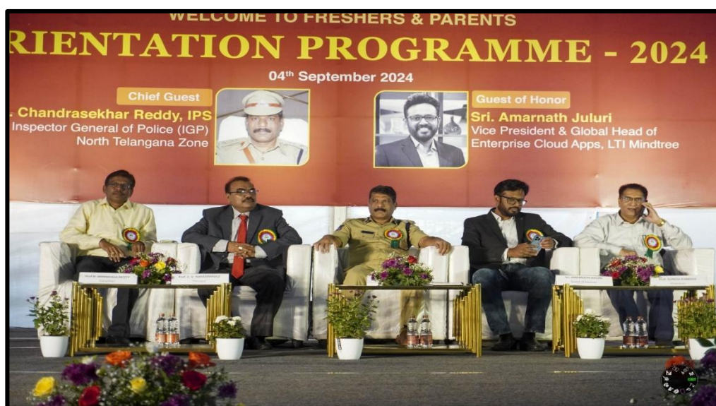
Principal and in-charge with the Chief Guest and Guest of Honour on the dias