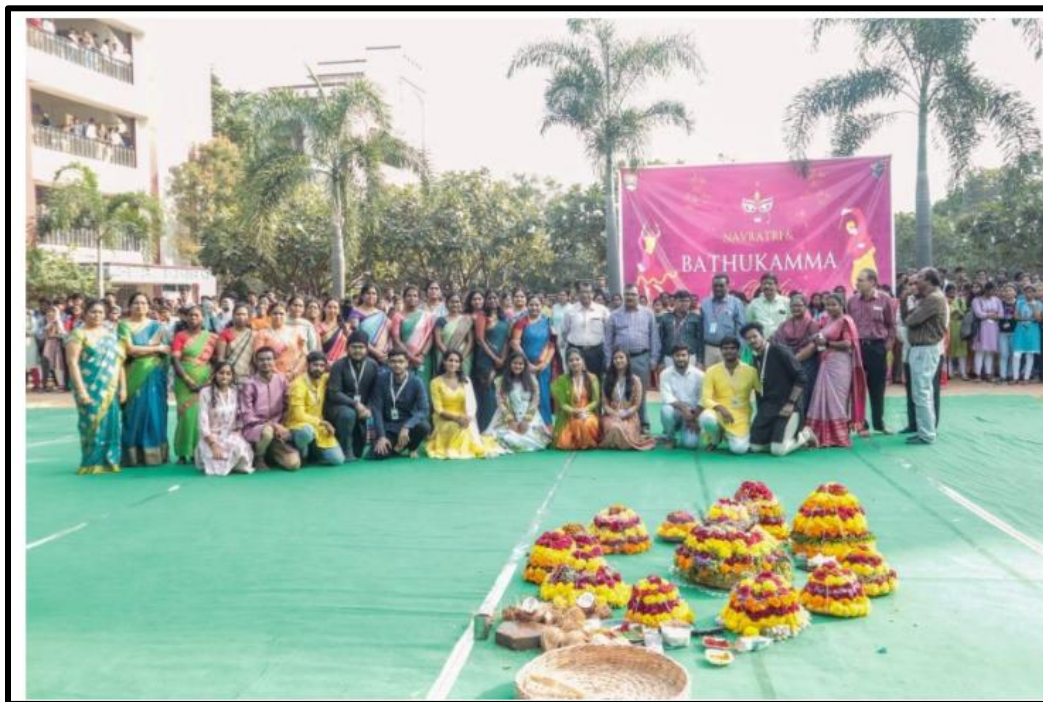
NAVRATRI AND BATHUKAMMA CELEBRATIONS