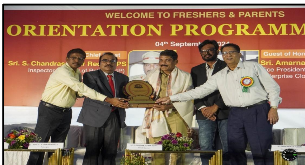
Felicitating the Chief Guest