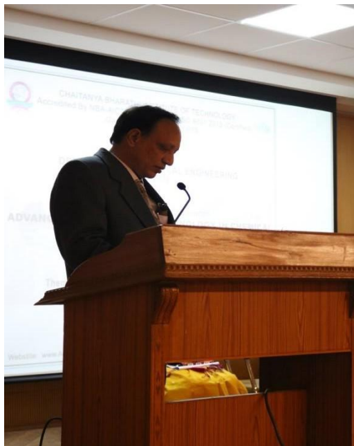
Address by Keynote Speaker