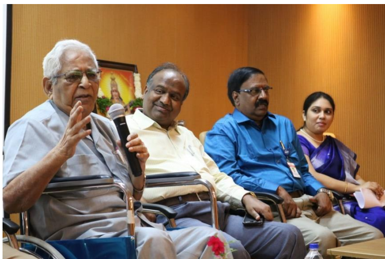
President, CBES addressing the gathering during the inaugural function