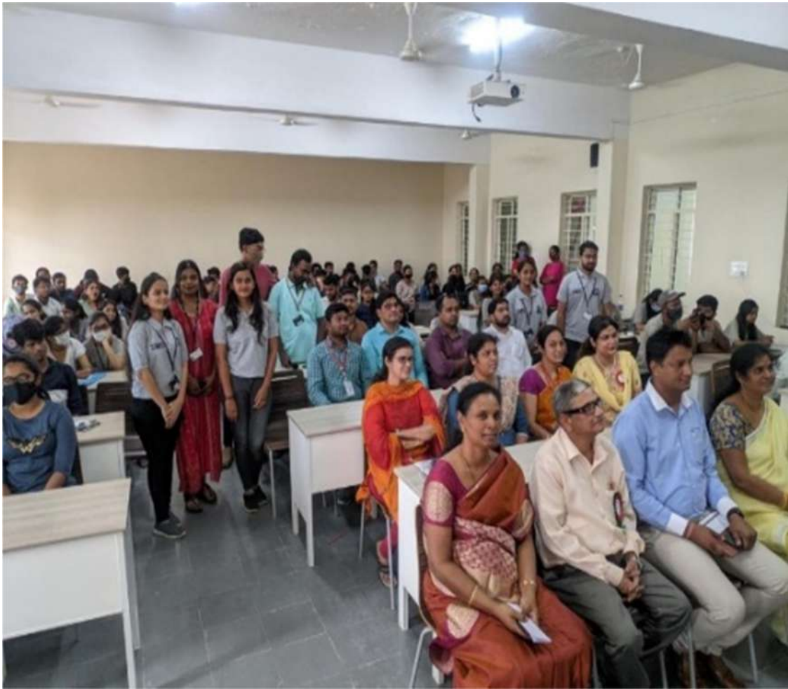
Faculty Members, Students and Participants during the event.