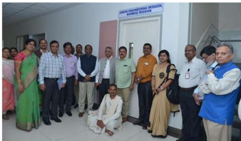
All the members of Bamboo Mission visited R&E Incubation centre, CBIT