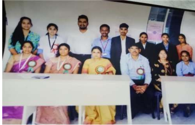
Staff and Students of SMS during Yukthi 2K19