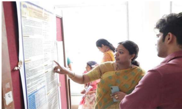
Participant explaining her poster presentation to the session chairperson