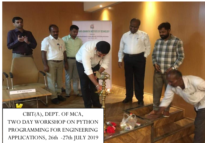
The Principal - CBIT, HOD of MCA, Speakers and faculty at the Inaugural of the Workshop