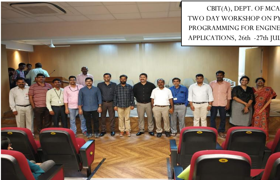
CBIT(A), DEPT. OF MCA, TWO DAY WORKSHOP ON PYTHON PROGRAMMING FOR ENGINEERING APPLICATIONS, 26th -27th JULY 2019