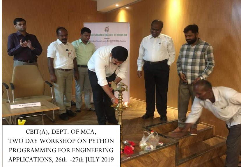
CBIT(A), DEPT. OF MCA, TWO DAY WORKSHOP ON PYTHON PROGRAMMING FOR ENGINEERING APPLICATIONS, 26th -27th JULY 2019