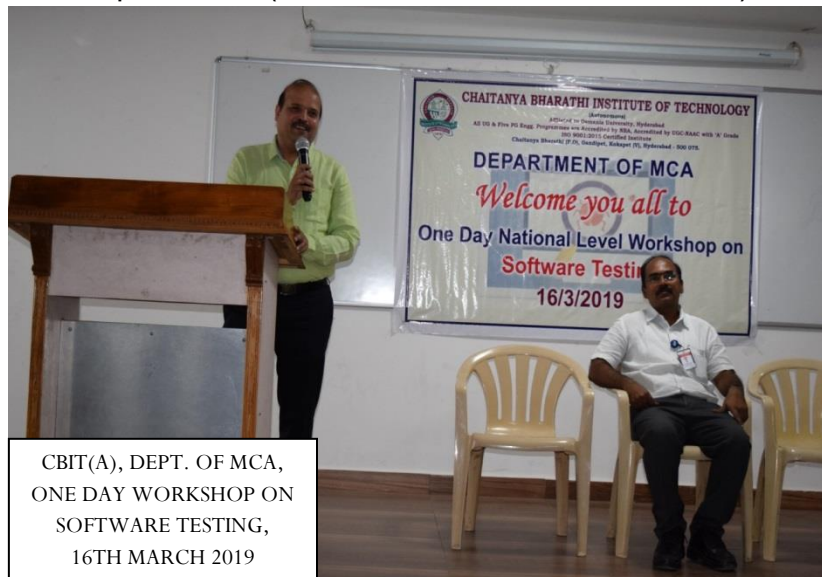
CBIT(A), DEPT. OF MCA, ONE DAY WORKSHOP ON SOFTWARE TESTING, 16TH MARCH 2019