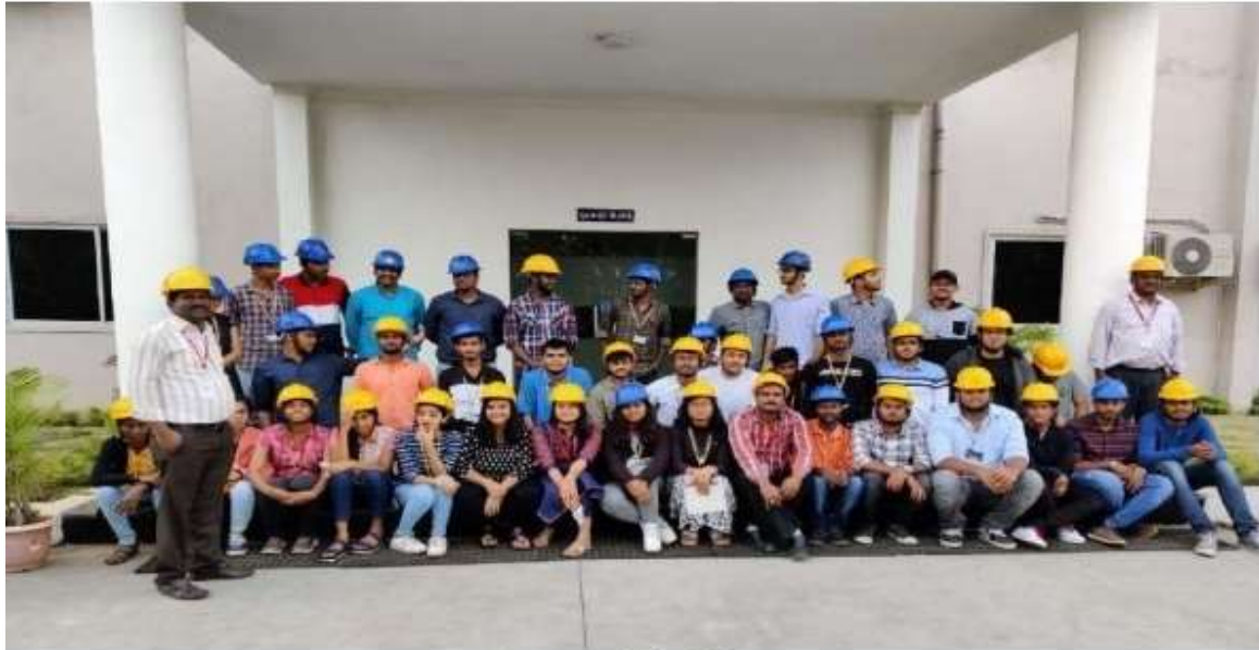
Innovare Labs, Vizag