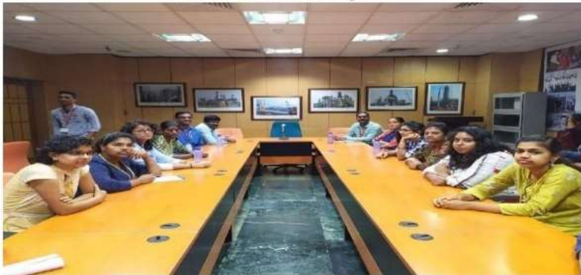
Hindustan Petroleum Corporation Limited, Vizag

➤ Industrial visit to Tripura Biotech Limited, December 2020