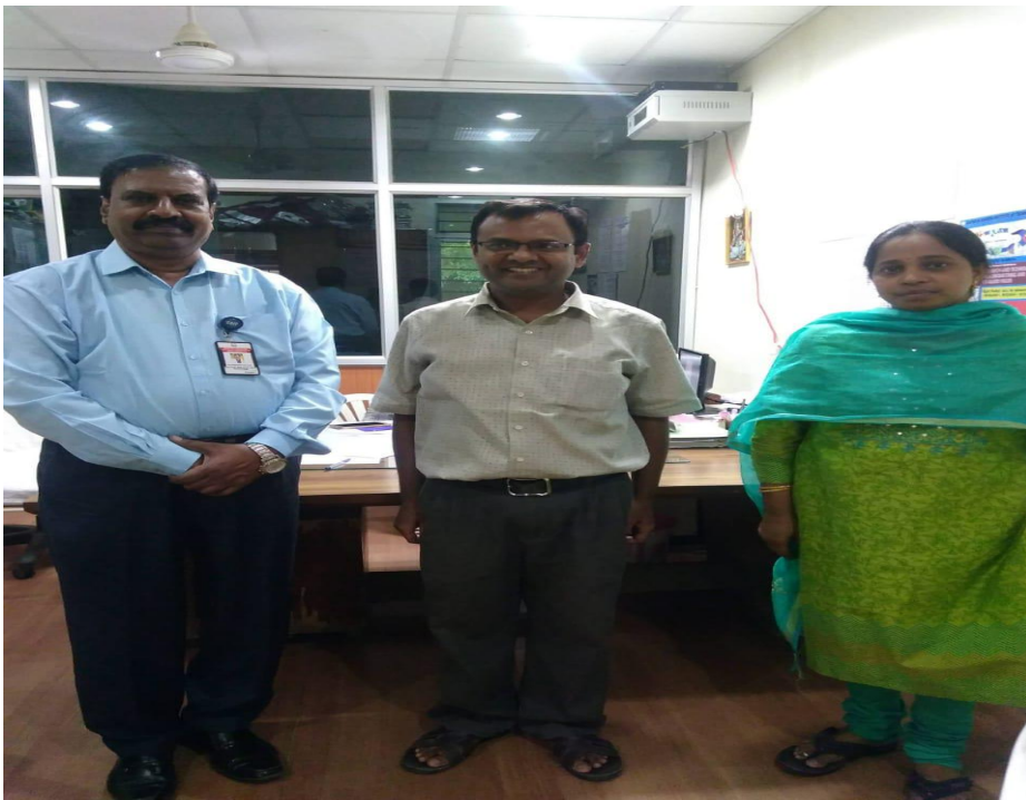
Guest speaker with Event coordinator