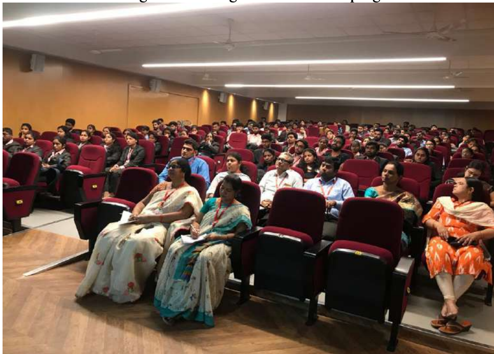
The Students and Faculty members gaining insightful information from the session