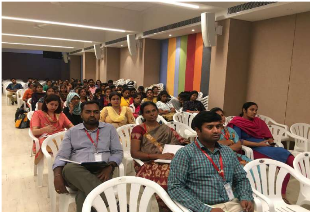
Management Students and Faculty Members listening to Knowledge-Driven Session