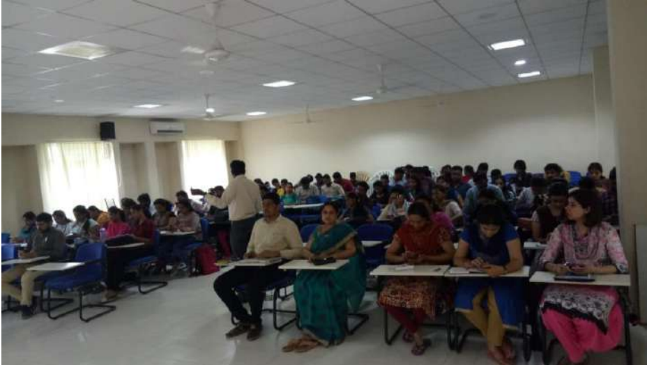
Faculty Members and students of CBIT-SMS accessing EBSCO database via their mobile phones