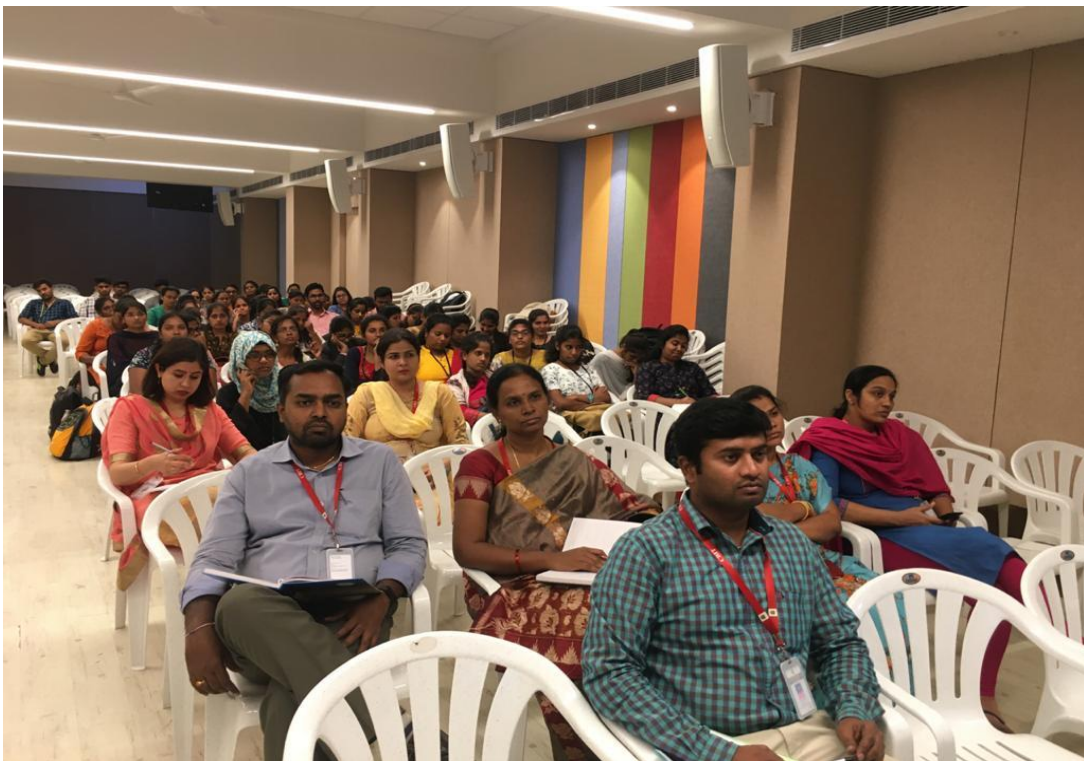
Management Students and Faculty Members listening to Knowledge-Driven Session