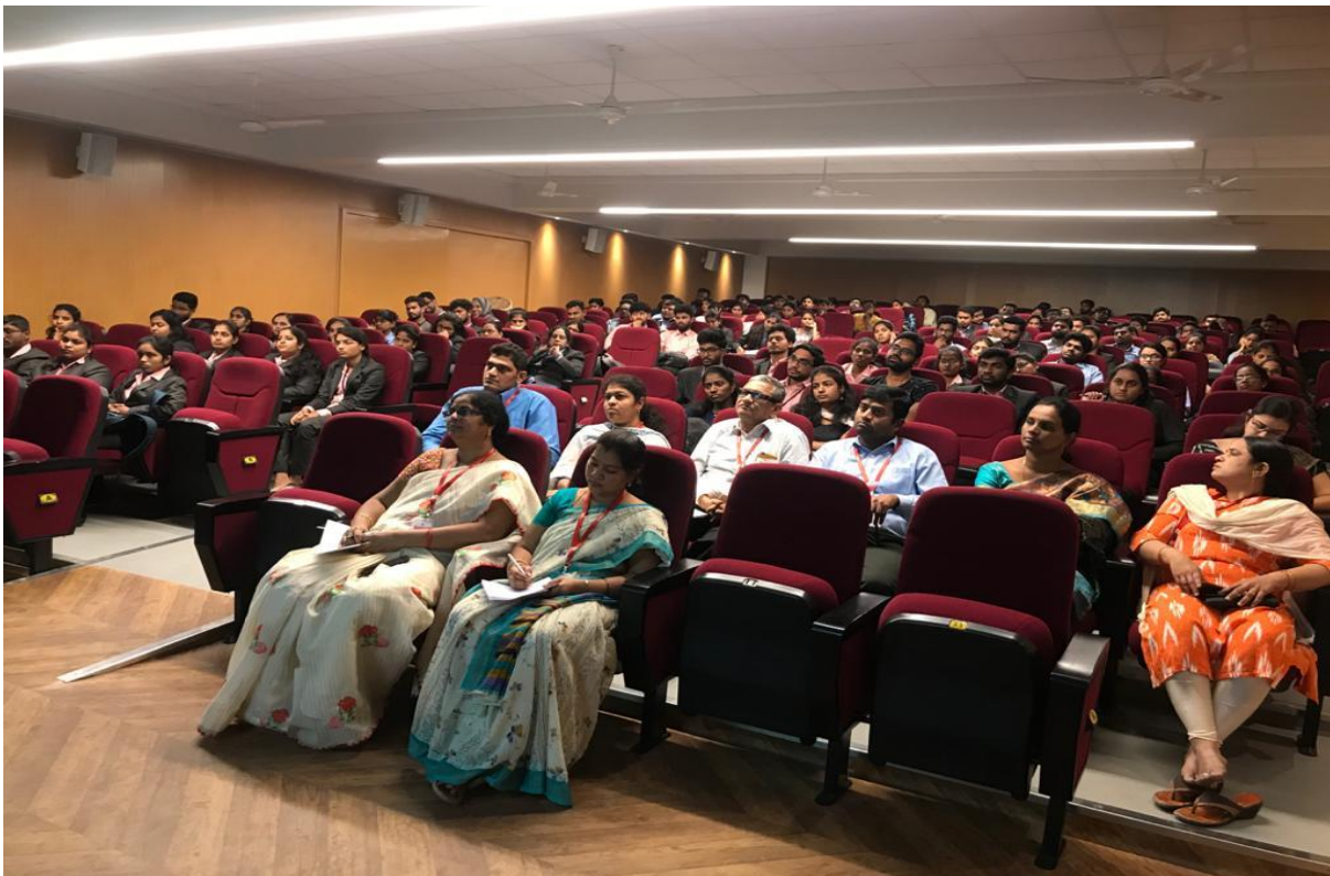
The Students and Faculty members gaining insightful information from the session