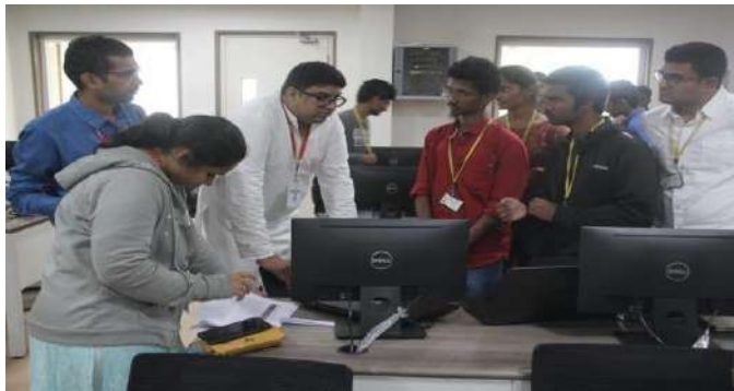
CSE Students interacting with the panel of Internal Hackathon 2020 and sharing their thoughts.