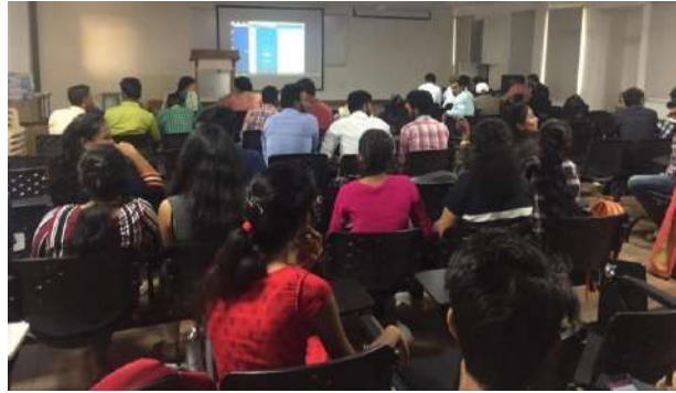
Participants Sharing their Ideas in Kony Hackathon