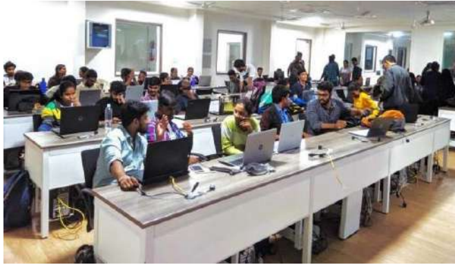
Department of CSE conducted INTERNAL HACKATHON FOR SMART INDIA HACKATHON- 2020 on 25 th Jan 2020.