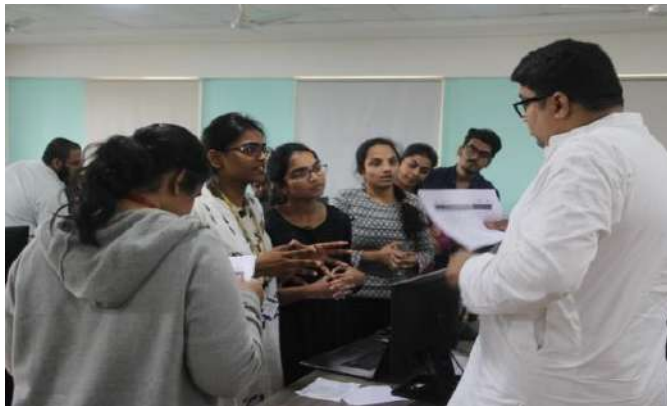
CSE Students explained the outcome of the idea of thought in Internal Hackathon 2020.