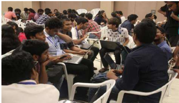
Participants working in Group activity of Django camp