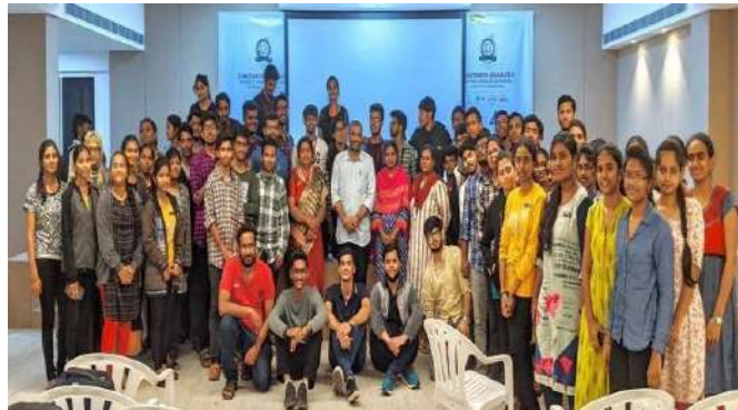
Students worked over night in Hacktoberfest Hackathon 2019. CBIT, Hacktoberfest Hackathon 2019 Training & Placement office, 25 th and 26 th October 2019