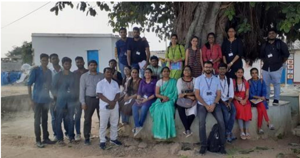
Staff and Students Visit to Elkaguda Village