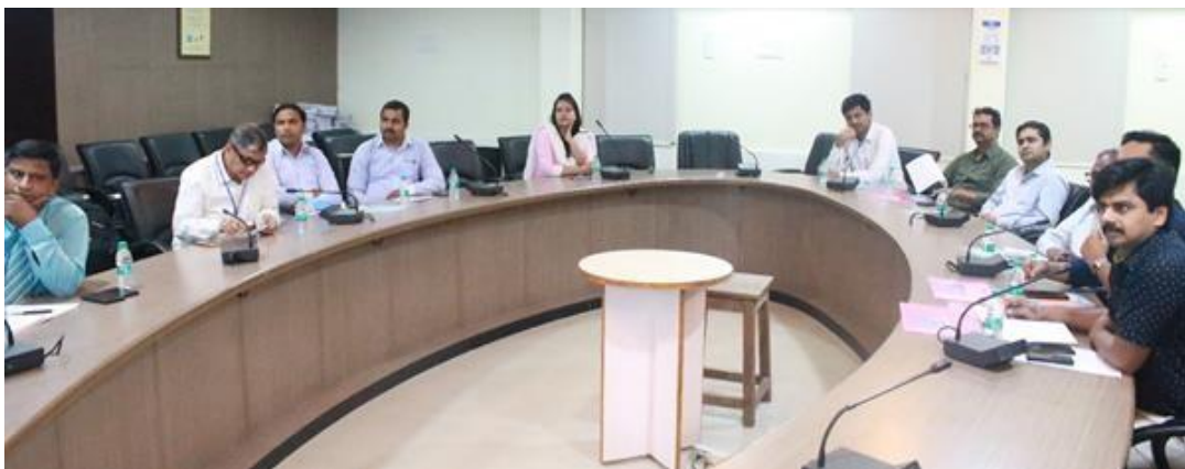
All the Executives having a Brainstorming Session