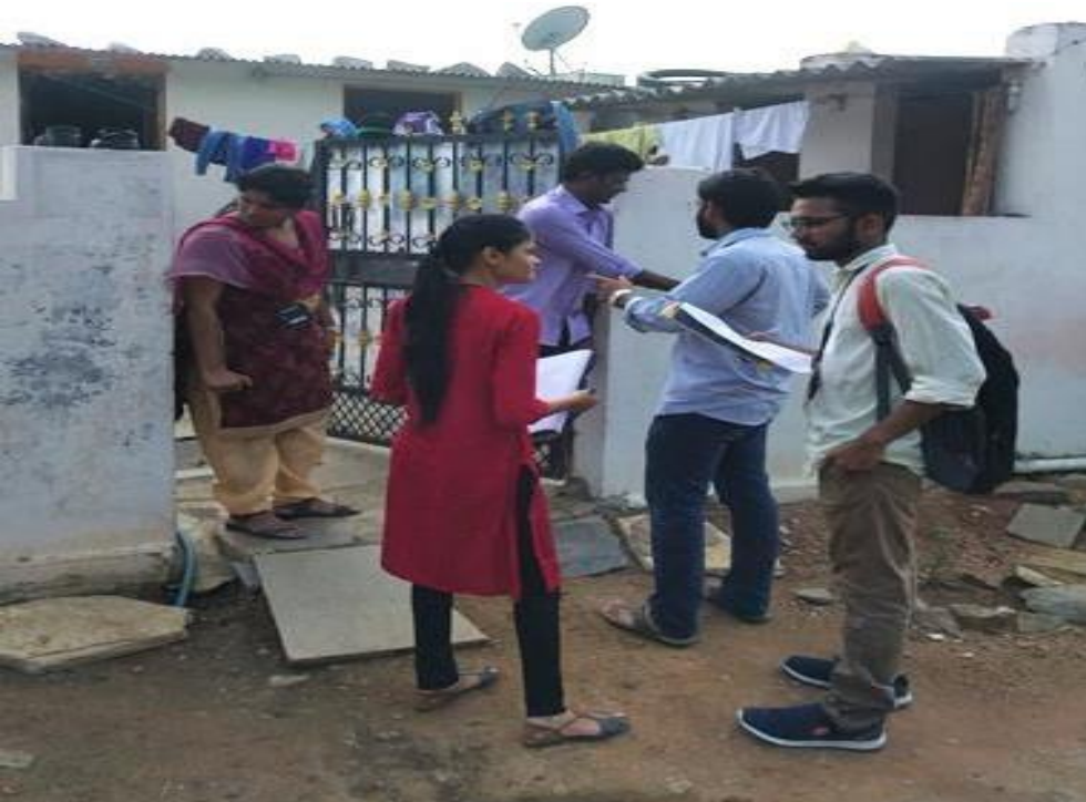
Survey was conducted by the Students at Chinna Shappur and Elkaguda village