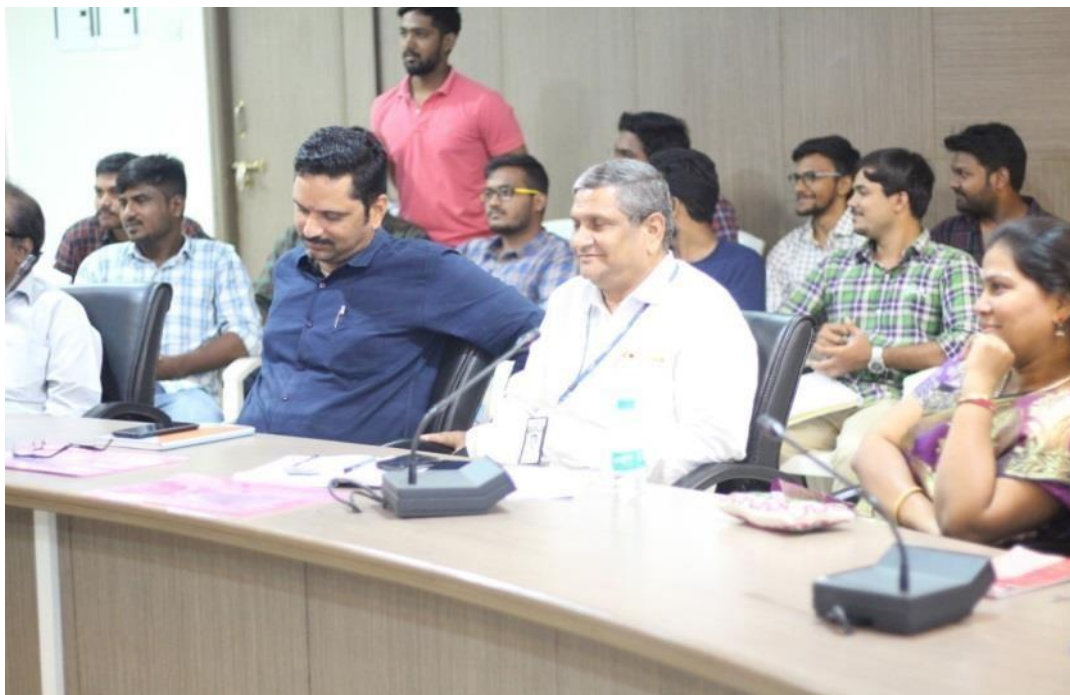
Students were getting Insightful and Practical Knowledge from Industry Practitioners.