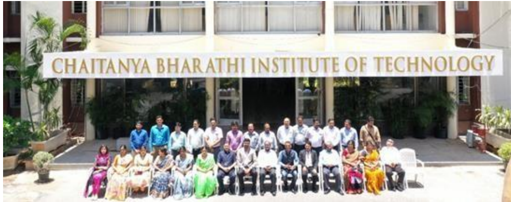
EDP Participants Group Photo with Principal, CBIT, Participants and Coordinators of EDP.