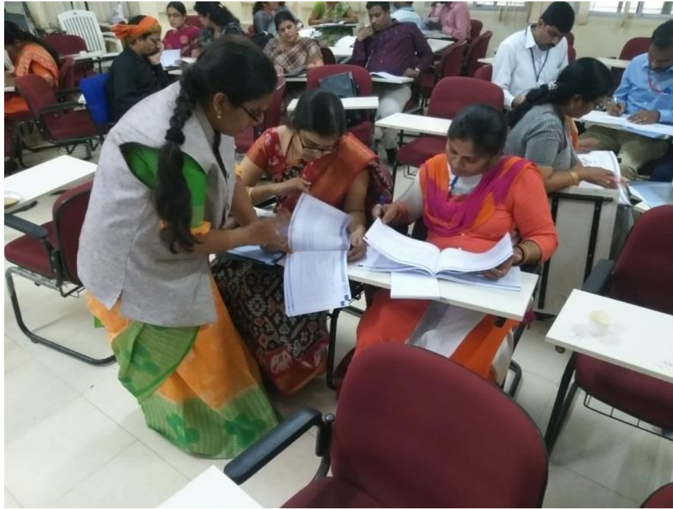
All the Faculty Members were involved in Group Activity of “Rural Immersion Program” on 14 th Nov 2019