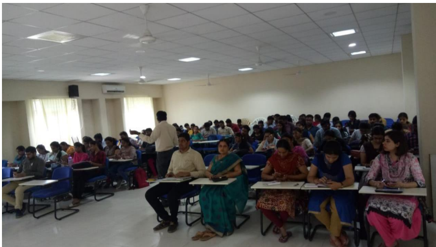
Faculty members and students of CBIT-SMS accessing EBSCO database via their mobile phones