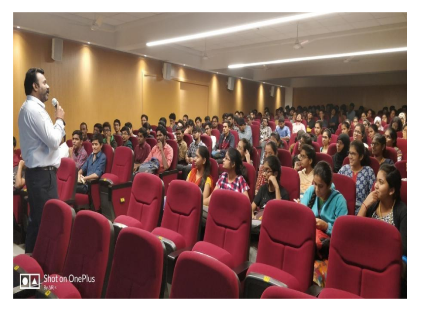
Byjus Representative with Participants

A Seminar on "How to Solve Verbal Ability by using Mathematical Equations and Career Guidance" on 04<sup>th</sup> January 2019 by Byjus representative.