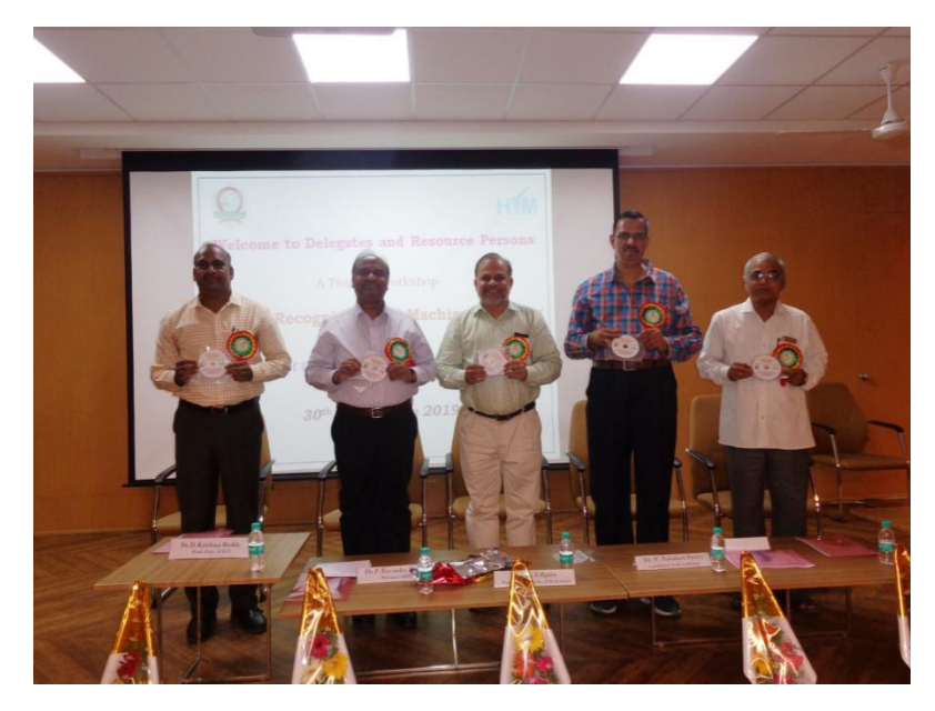
Inaugural function on Pattern Recognition and Machine Learning