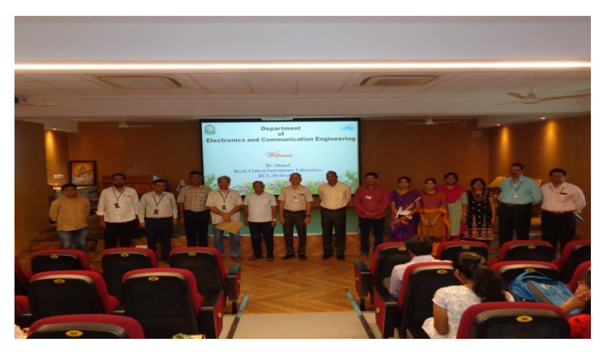
Valedictory function of "Vikram Lander: chadrayaan-2"