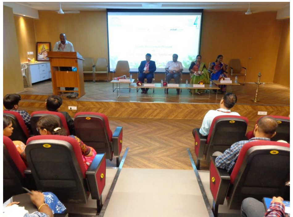
Inaugural function of One-week Faculty Development Programme

One-week Faculty Development Programme titled "IoT for Emerging Applications", Electronics & ICT Academy of IIT Guwahati, Assam in association of Dept of ECE, CBIT (A) was conducted during 4<sup>th</sup> to 8<sup>th</sup> February 2020.